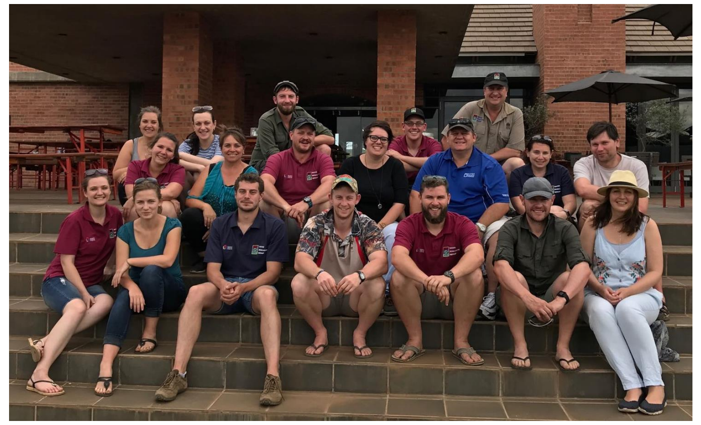
Very successful Workshop (Seminar) at the Olifantsnek Dam, Hex River, as part of our NRF/DAAD funded SA-German bilateral project on Platinum Group Elements (PGE).