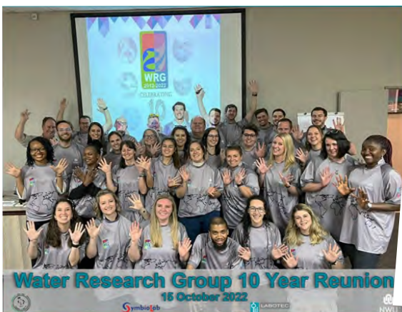
Group photo of current members and alumni taken at the brunch with the special edition shirts printed for the event

This event would not have been possible without donations from Symbiolab, Labotec (Pty) Limited, and Inqaba Biotech.