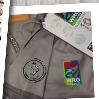
The special edition shirt, with the logos of Symbiolab, Labotec (Pty) Limited, and Inqaba Biotech, and the special printed booklet with 10 years of accomplishments